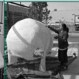
Students from Artists for Humanity building a piggy bank float for the Dorchester Day Parade.