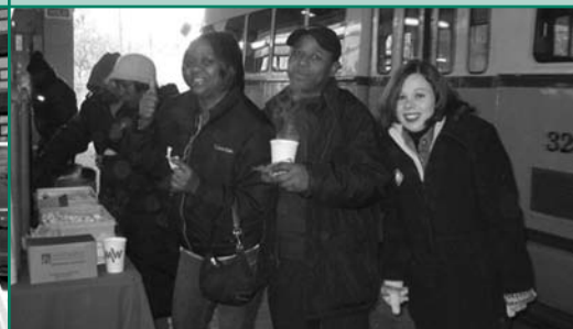
Mt. Washington Bank employees braving the cold to hand out free coffee to early morning commuters at the Ashmont T station.