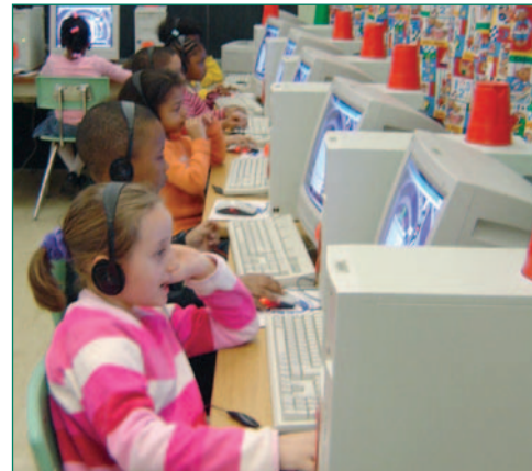
A donation to the Condon School will help expand the computer lab.

In addition to meeting these specific requests, the Bank funds several scholarship initiatives, both community-wide and at specific schools through the Mt. Washington Bank Scholarship Program. In the 13 years since its inception, the program has awarded over $70,000 to area students. Scholarships assist with education expenses at tuition-based high schools as well as various colleges and universities.