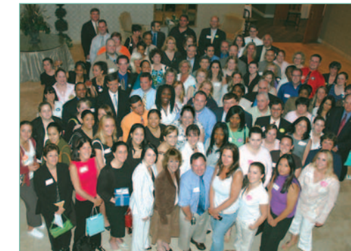
Mt. Washington Bank employees celebrate 113 years at the Venezia Restaurant.

Everyone had a great time, and the event provided a wonderful opportunity to look at how far the Bank has come from its first days as a