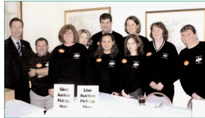
Mt. Washington Bank employees with Congressman Lynch volunteering at All Hallows Auction.

Staff members recall an All Hallows Auction several years ago as the first event for which the Bank organized a “Cash Out Team.”