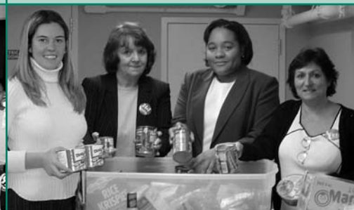
During the Thanksgiving food drive customers and employees donated items for local food pantries, including those at St. Vincent Church, the Old Colony Task Force and Fourth Presbyterian Church.